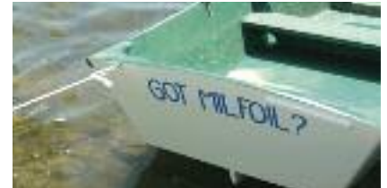
Local boat poking fun at milfoil issue 100-plus

Following the treatment the members of LFA collected water samples on a prescribed schedule during the summer for the purpose of herbicide residue testing. In addition, Lycott divers removed several acres of previously installed benthic barriers panels, a condition of the state permit. A fall survey was conducted consisting of